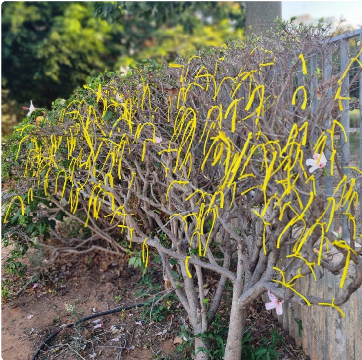
Yellow ribbons on a tree in Ashdod, Nov. 2023, Photo: Ira Mazor

What is my obligation to fight for other people's freedom? How can I show they have not been forgotten using symbols and action?