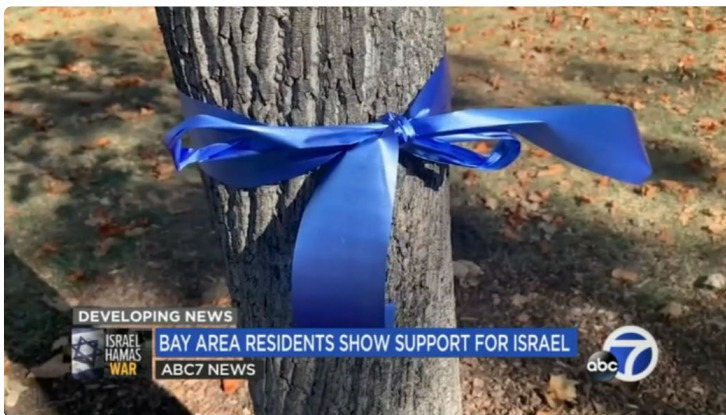
Bay Area Hillel students at Stanford tie Blue ribbons on trees. October, 2023