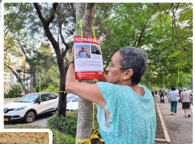
Tying yellow ribbons around trees in Haifa. October, 2023.