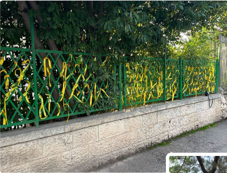
Yellow ribbons outside a school in Jerusalem. Dec. 2023